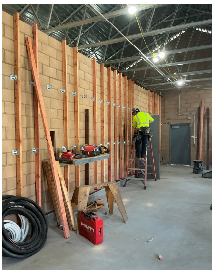
Framing Inside Pump Room, Mechanical Building