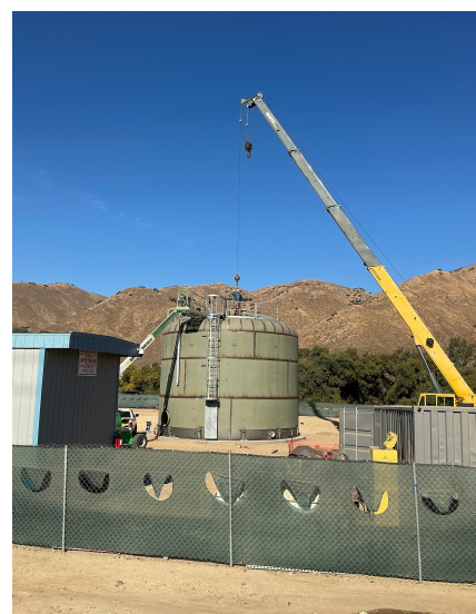
Steel Tank Construction

For questions, or to obtain additional information, call our construction hotline Monday to Friday from 8 a.m. to 5 p.m or email LeeLake@EVMWD.net